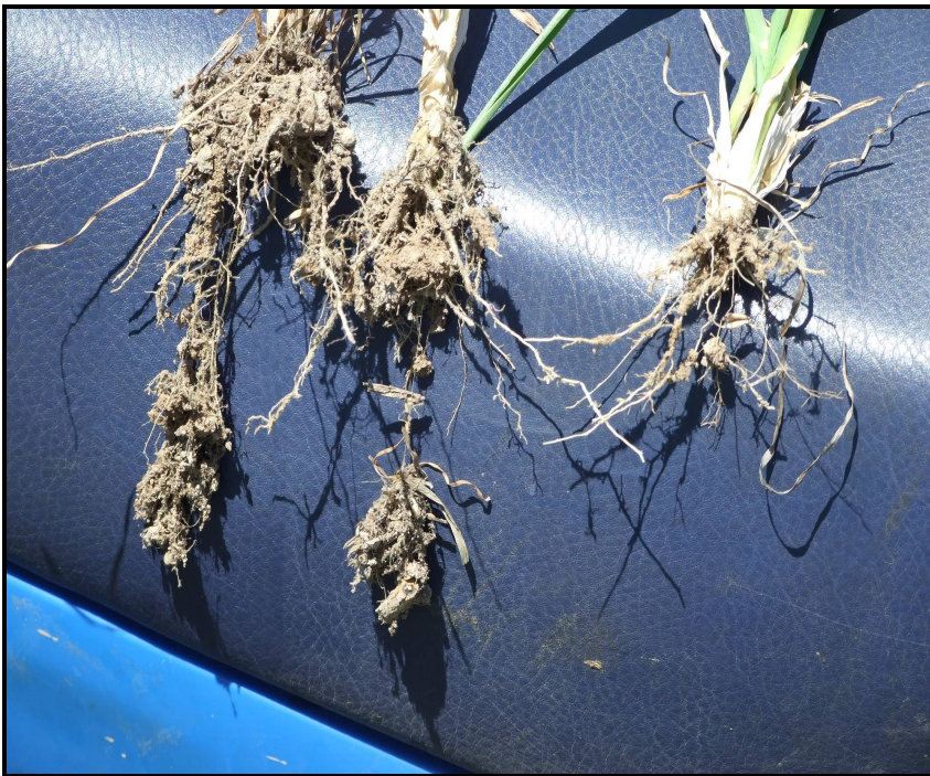
Fig.2. The two wheat plants on the left were grown with perennial grasses in a Pasture Crop treatment while the wheat plant on the right was grown in adjacent bare soil, amended with 100kg/ha DAP.

Note the little lumps adhering to the roots of the Pasture Cropped wheat (Fig.2). These clusters are formed by microbes utilising liquid carbon from the roots. Microaggregates, too small to be seen with the naked eye, are bound together by microbial glues and gums and the hyphae of mycorrhizal fungi (also using liquid carbon), to form bigger lumps called macroaggregates, generally 2-5mm in size (around 1/8 th of an inch in non-metric terms).